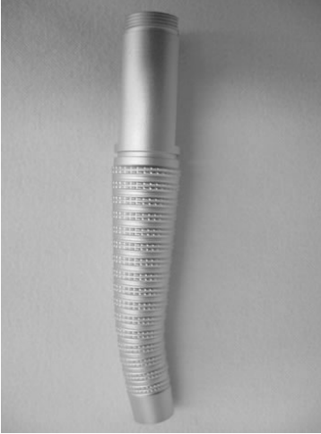
Medical device plated with a duplex coating of 0.0003 electroless nickel and 0.0003 hard chromium.